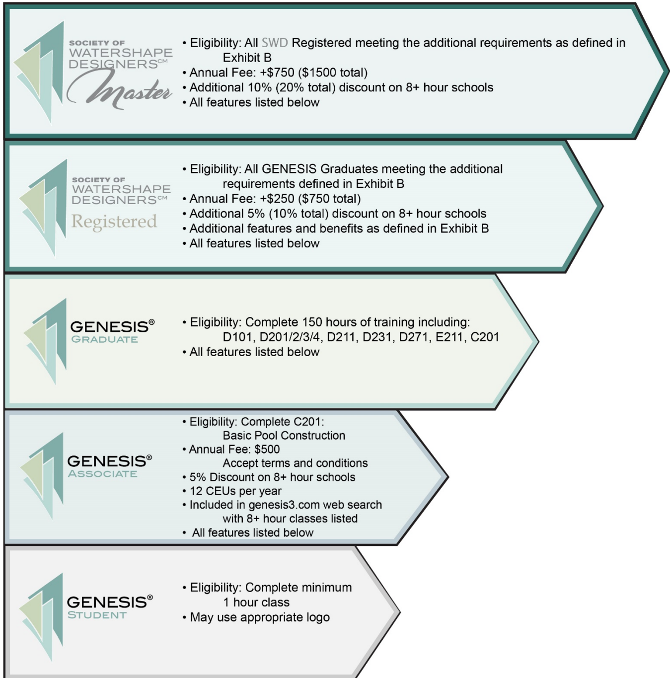
EXHIBIT A. EDUCATION AND CERTIFICATION PROGRESSION